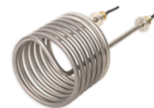
Resistor type heater elements in highly corrosion-resistant alloy