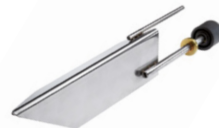
Replaceable stainless steel large area electrodes for different conductivities