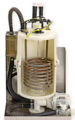
SteamKit H06 with capacitive water level sensor