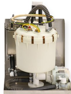
SteamKit H02 with float switch