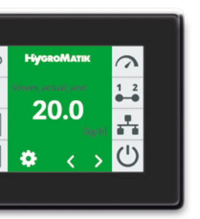
Capacitive 3.5" touch colour display for excellent ease of operation.