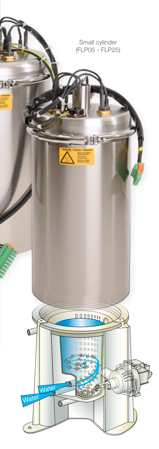
Integrated rinsing and lime collection system