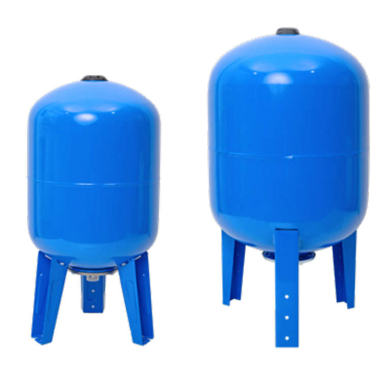
Pressure expansion tank with stand Volume optionally 80 to 500 litres